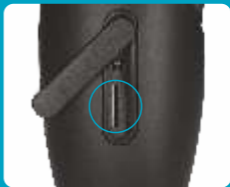
SD Card Slot